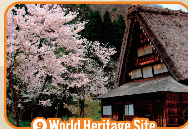
9 World Heritage Site, Shirakawago Village