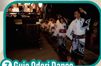
7 Gujo Odori Dance Festival