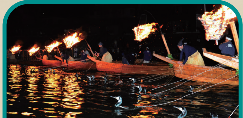
3 Ukai Cormorant Fishing