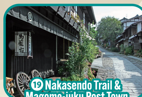
19 Nakasendo Trail & Magome-juku Post Town