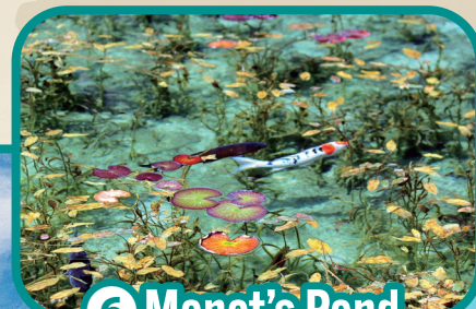
6 Monet's Pond