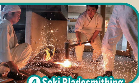
4 Seki Bladesmithing