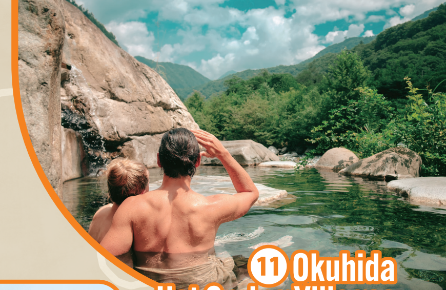
11 Okuhida Hot Spring Villages