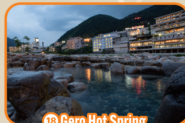
18 Gero Hot Spring