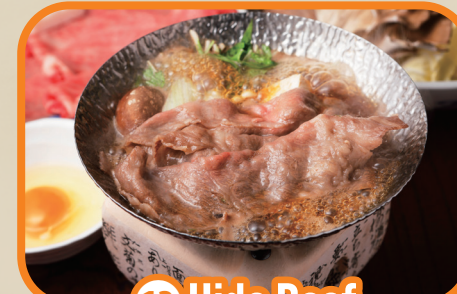
13 Hida Beef