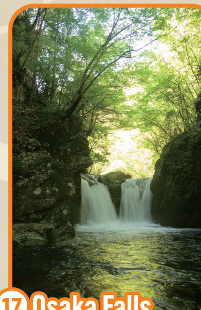
17 Osaka Falls