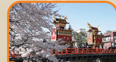
15 Takayama Festival