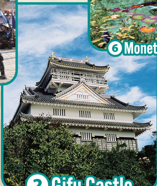
2 Gifu Castle