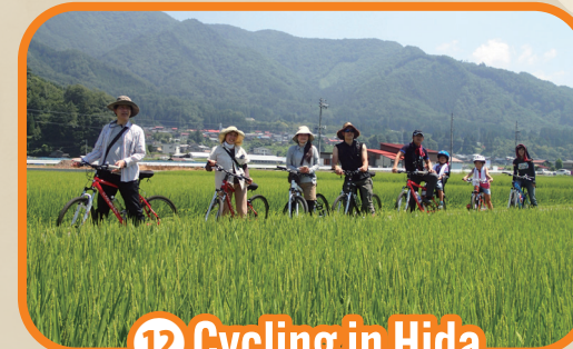
12 Cycling in Hida