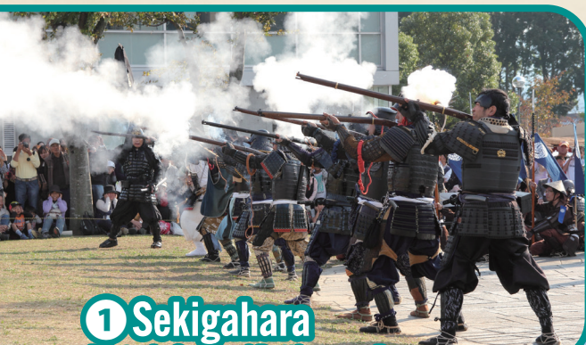
1 Sekigahara (Historic Samurai Battleground)