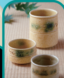
20 Ceramic Ware in Tajimi