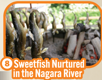
8 Sweetfish Nurtured in the Nagara River