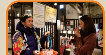
16 Takayama Sake Brewery