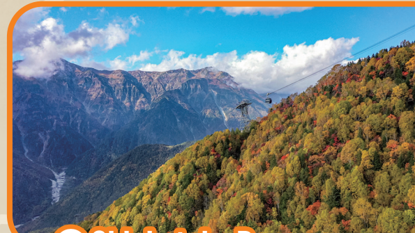
10 Shinhotaka Ropeway