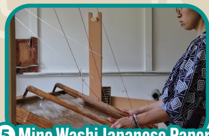
5 Mino Washi Japanese Paper