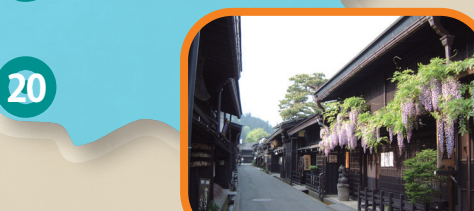
14 Old Quarter of Hida Takayama